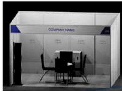
3X4 WALK ON PACKAGE STAND AISLE